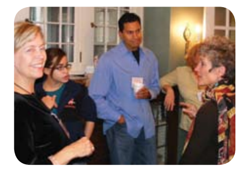
Washburn Neighborhood House Gatherings

The acclaimed International Baccalaureate (IB) program that was originated at Washburn will be returning to the school. Arts are alive with The Fall Fine Arts Kick-off, Winter Cabaret, Spring Musical, drumline, choir and band. Washburn's athletic program remains a mainstay of the school with a focus on "fitness for life," the Athletic Leadership Academy summer program, as well as teams that advance to state championships.